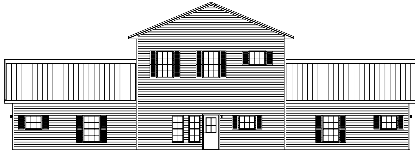
BACK SIDEWALL ELEVATION