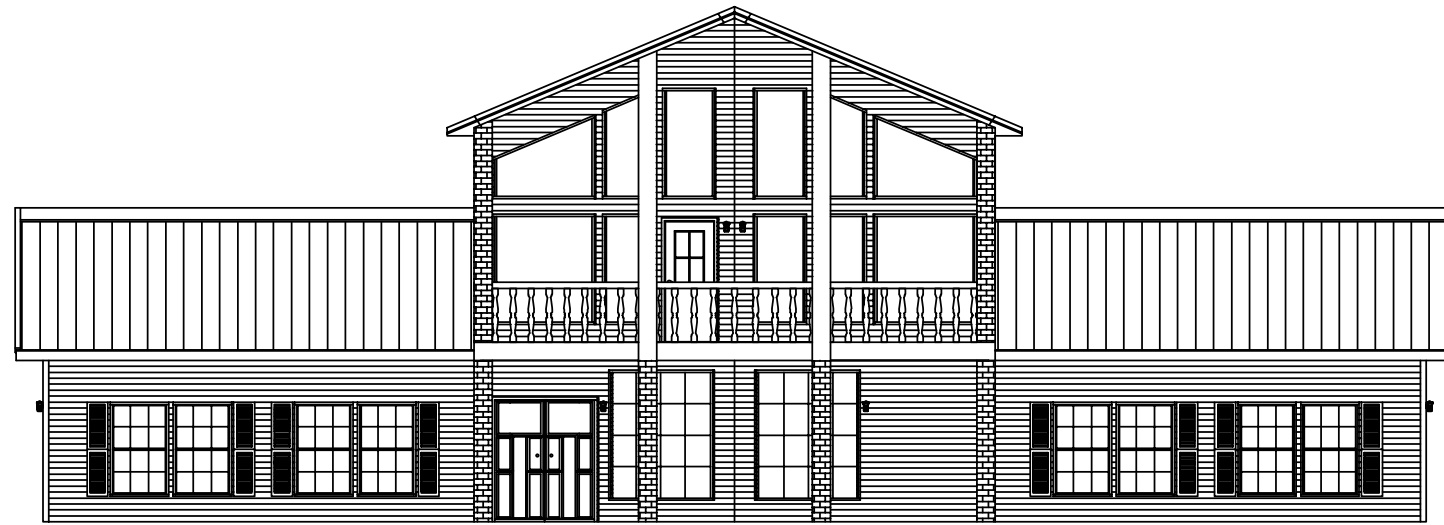
FRONT SIDEWALL ELEVATION