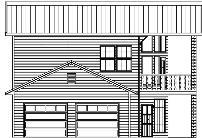
LEFT ENDWALL ELEVATION