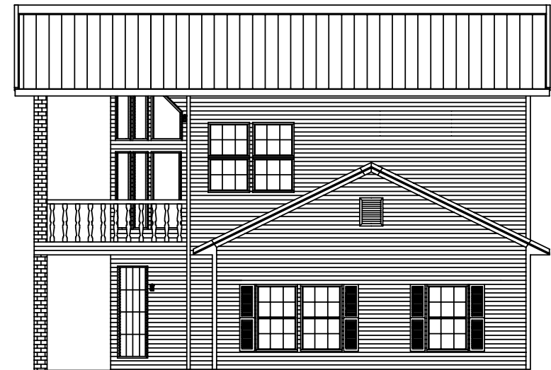
RIGHT ENDWALL ELEVATION